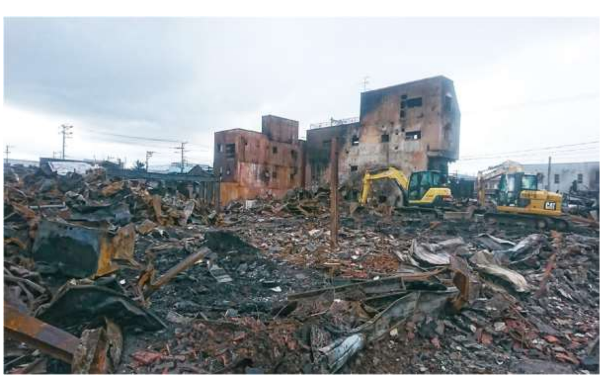
Shopping street turned into devastated land

Each fire department is requested to start their studies quickly and to review the supporting organization by referring to the measures to be demonstrated by the FDMA.