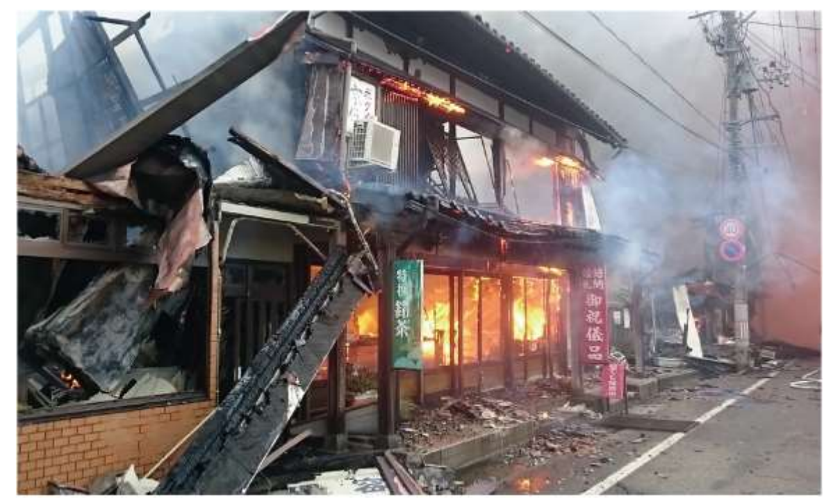
Flames breaking out at a location 200 m away from the original location of fire

The FDMA is planning to demonstrate measures to review these support schemes such as introducing cases of the advanced support schemes stated above by the end of July.