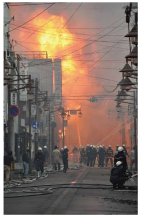
A pillar of fire much higher than a 3 story building

The large-scale fire which broke out in Itoigawa City, Niigata Prefecture at about 10:20 on December 22 (Thu.), 2016 was the first large-scale fire in an urban area after the large fire in Sakata City in 1976, meaning the largest one in the past 40 years (excluding the ones caused by earthquake), with the fire causing 17 injuries and damaging 147 buildings. This paper described the basic approach after the "Review Meeting on the Future Approach to Firefighting after Lessons Learned from the Large-scale Fire in Itoigawa City" held by the FDMA.