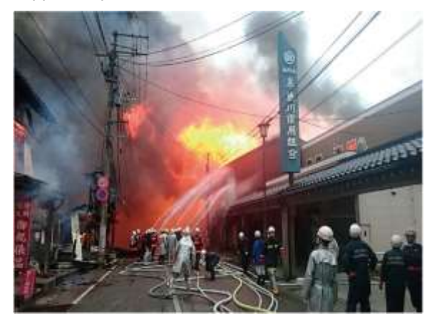
All-out firefighting

It is necessary for each fire department to not only deploy their maximum firefighting power including the volunteer fire corps by considering, based on mobilization standards, the number of firefighters which can be mobilized, the status of vehicles and the necessity of security watch in jurisdictional areas other than the origin of the fire, but also issue support requests at the same time.